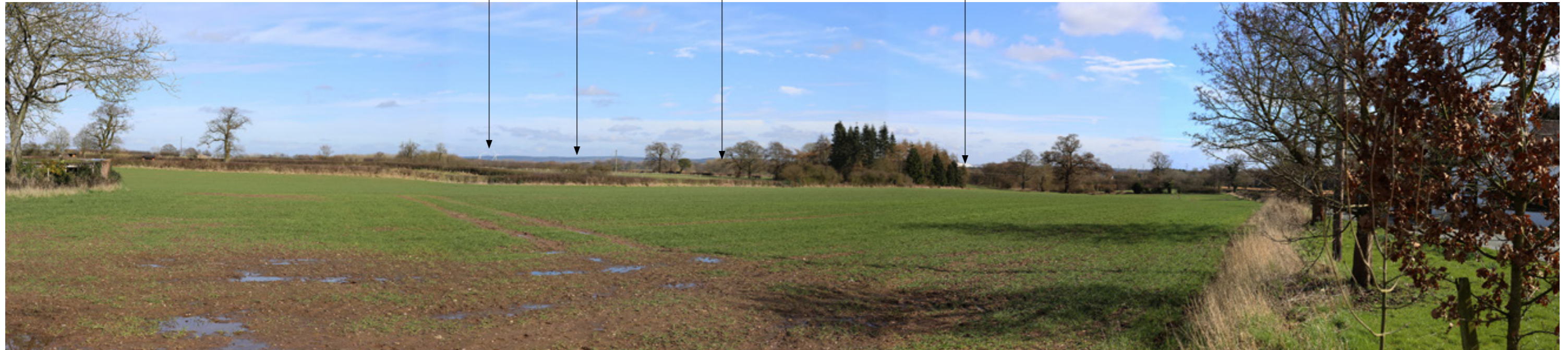
PHOTO VIEWPOINT 21

Rodbaston Wind Turbines Cannock Chase General Direction of the Site Veolia ERF