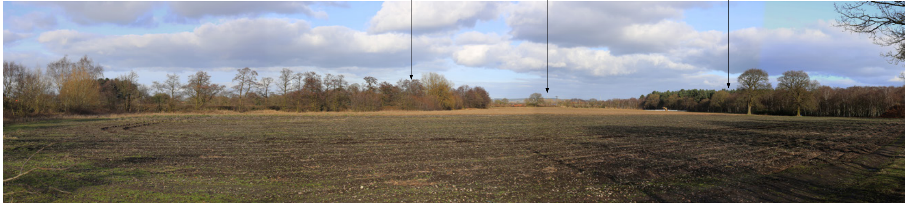
PHOTO VIEWPOINT 5

Bericote Development (under construction)